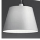
TOLOMEO MEGA DIFF.RASO 420 0781030A