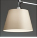
TOLOMEO MEGA DIFF.PERG.420 0780030A