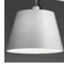
TOLOMEO MEGA DIFF.RASO 520 0781060A